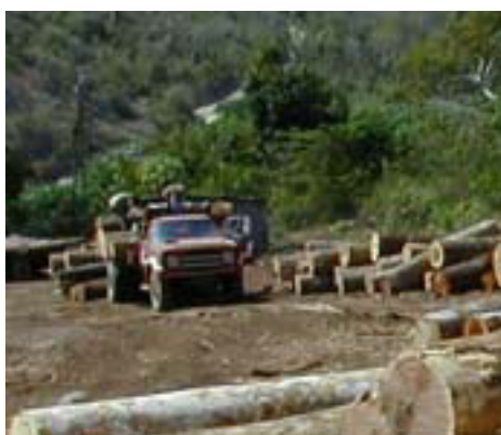
Under a market based REDD scheme, countries with low deforestation rates could lose out. Image: Rainforest Foundation UK

Negotiations at the UNFCCC on reducing emissions from deforestation and forest degradation (REDD) are considering several different options for how this reduction is to be measured, and on what basis payments are to be awarded. In brief, the process involves the setting of baselines, with countries being awarded payments (positive incentives) for making improvements against this baseline; but within this framework there are a number of different possible approaches. Much depends on which model is chosen, and the potential consequences are not straightforward. Nor are they necessarily what advocates of the different approaches would expect or want.